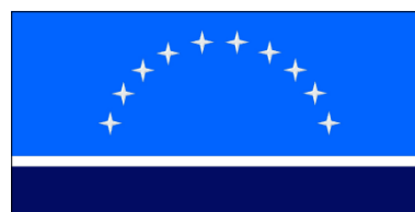
HOVD (26 avril 2011)