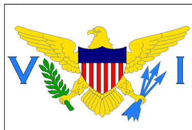
Actuel - Adopté le 17 mai 1921