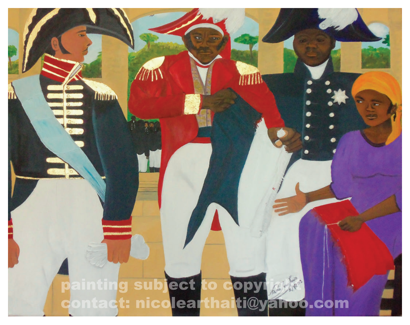
Making of the Haitian Flag, by Nicole Jean-Louis (2012)

What was the design of the "original" Haitian flag? What exactly were its origins and the circumstances of its adoption? What flags were actually used in the revolutionary years leading to Dessalines' proclamation of the Republic in 1804? This study by the Haitian scholar and educator Odette Roy Fombrun explores these questions, symbolically significant in Haitian society and long the subject of debate, in light of the historical record. She quotes extensively from eyewitness sources and later historical accounts published only in French and long out of print. The Flag Heritage Foundation is pleased to make this work available for the first time in English, along with a new preface and notes and a specially redrawn flag chart.