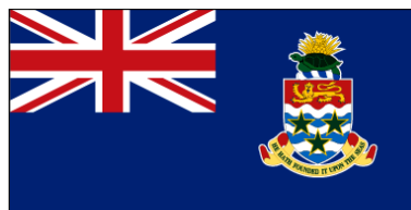
Actuel - Adopté le 25 janv. 1999 (Pavillon gouvernemental)