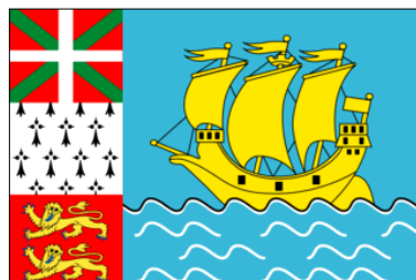
Drapeau local (Adopté en 1982)